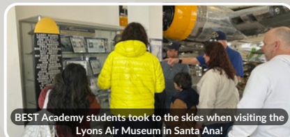
BEST Academy students took to the skies when visiting the Lyons Air Museum in Santa Ana!